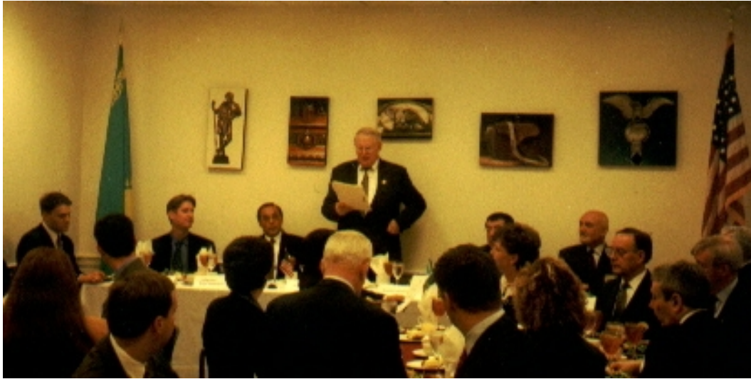
Representative Joseph Pitts ( above, center ) addresses guests at the Association's Capitol Hill Luncheon on the 10 th Anniversary of the Independence of Kazakhstan, December 6, 2001.